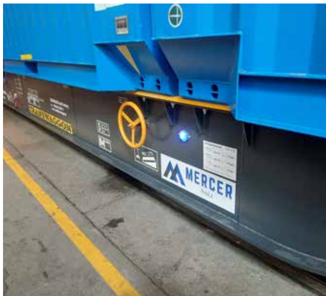
Real-time visualisation during loading enables immediate correction

The monitoring information is set according to application or customer requirements and can basically be divided into two data blocks: Relevant data about the wagon are captured, processed and transferred to a web service in real-time. This guarantees the highest availability of the data. The data is transmitted via an encrypted, secure connection.